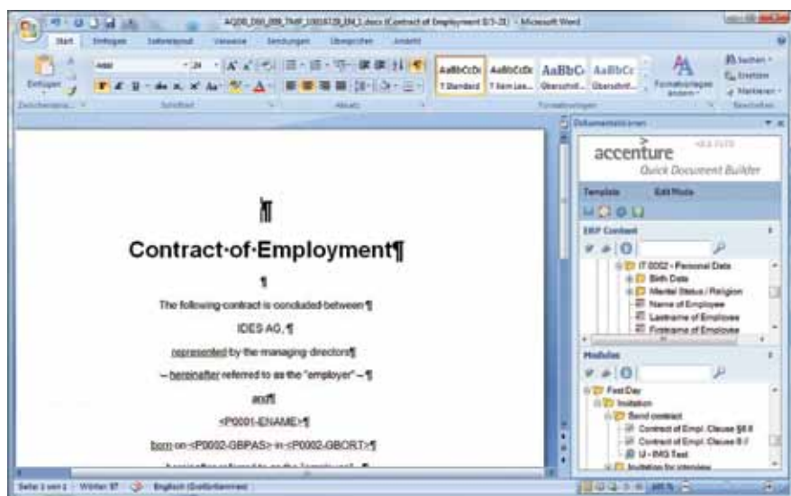
Edit template content with Microsoft Word

Setup of imprinted barcodes can make it easier to work with documents that require the recipient's signature. Scanning barcodes allows a workflow so they can be automatically assigned to the right transactions or stored in the appropriate place.